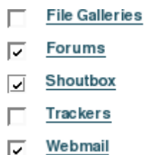
Figure 1. Enabling Shoutbox

1. Enable the Shoutbox feature on the Administration:Features page by clicking on the checkbox and clicking the "Change Preferences" button at the bottom of the page to save your change.