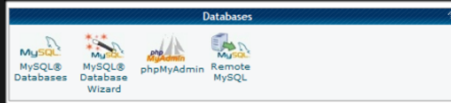
The MySQL and phpMyAdmin applications in cPanel 11.

Creating a database (and a database user) is a very simple operation. Essentially you will create a blank (empty) database that the Tiki installer will later populate with the correct tables and data.