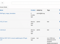
Kaltura list-media screenshot

The Tiki-Kaltura integration was started in Tiki4 as a "Google Summer of Code" project, and has since evolved.