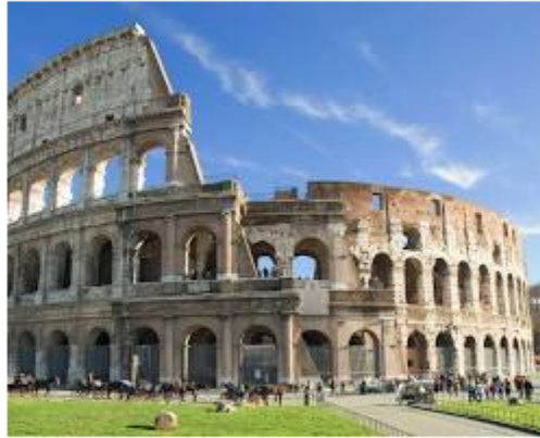
Colosseum, Rome, Italy

Colosseum, giant amphitheatre built in Rome under the Flavian emperors.