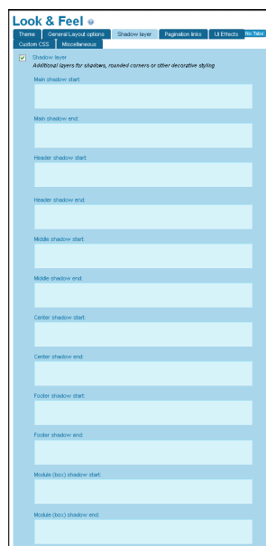
Shadow Layer tab

The jQuery Sortable Tables feature must be activated for the sort feature to work.