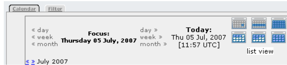
Calendar Navigation Bar